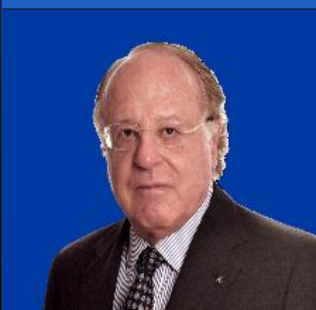
Paolo Scaroni Board Member